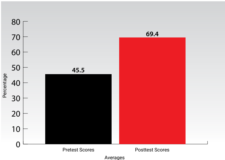
Figure A: Pretest and Posttest Averages

The average gain of 23.8% is equivalent to six additional mathematical concepts mastered, which showcases growth of more than one skill each week of instruction. The effect size of the data is significant, indicating growth as a result of the intervention.